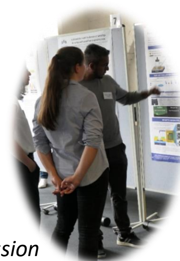
Discussions during the Poster Session